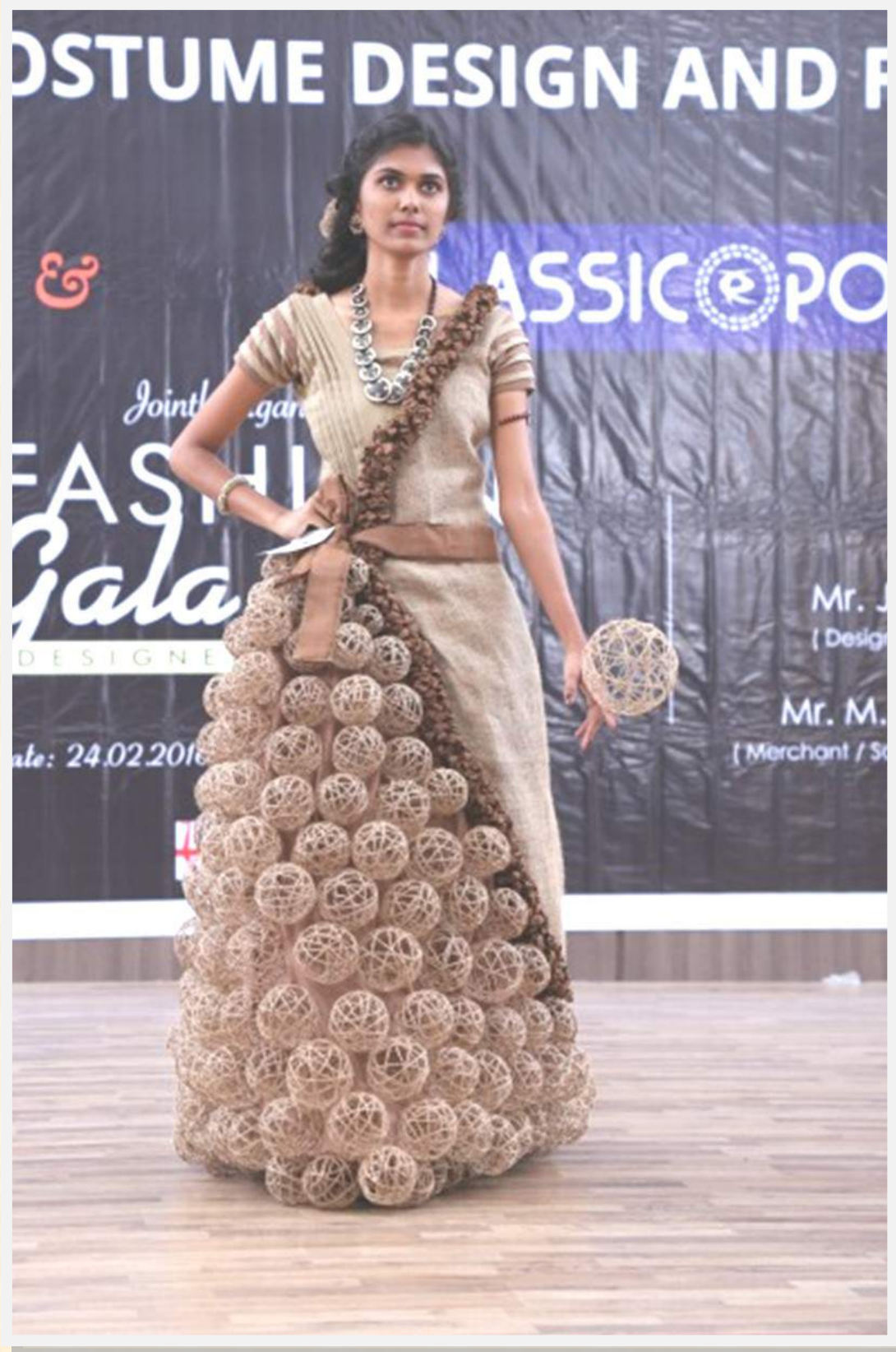
Goni-the new look