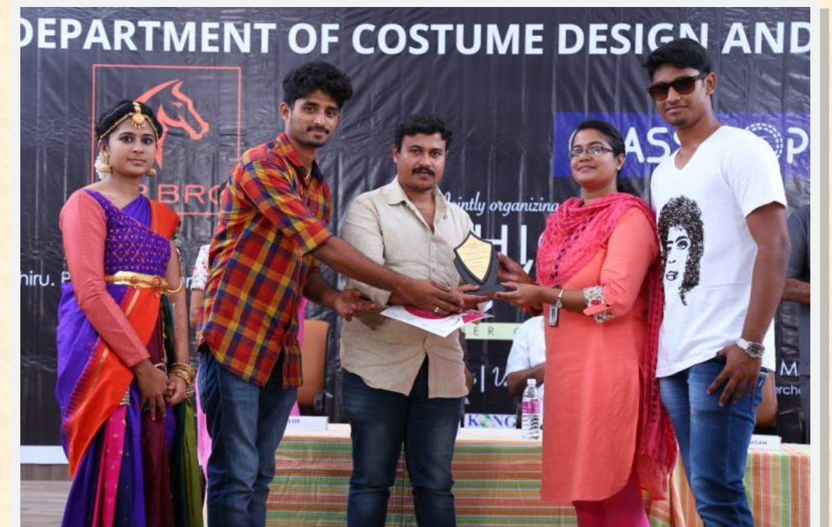
Best Designer Award for UG