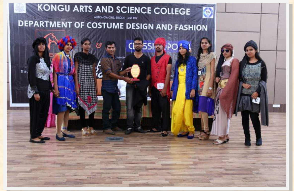
Best Designer Award for PG